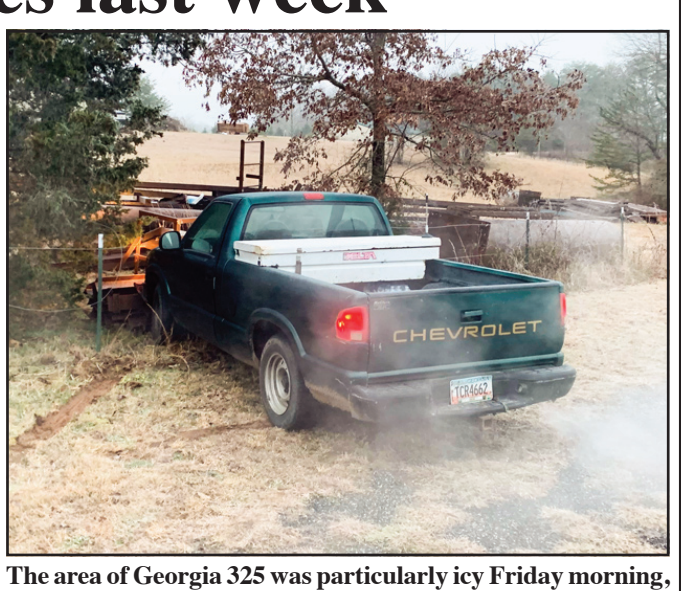
causing at least four vehicles to slide off the roadway.

By Brittany Holbrooks North Georgia News Staff Writer