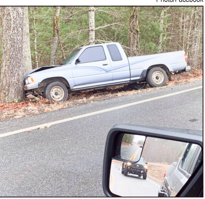
Slippery road conditions were widespread across the county on Friday after some precipitation the night before left a nasty surprise for drivers that morning.

your vehicle's battery, wipers, coolant, tires and other systems that can take a beating when the