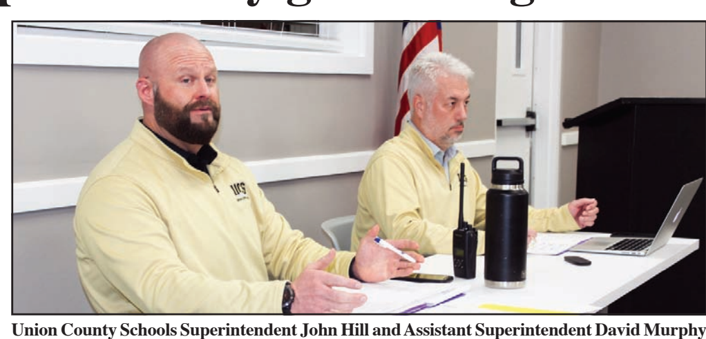
hosted the in-person aspect of last week's Board of Education meeting, with board members attending via Zoom.

In other business, School Board members did some beginning-of-the-year housekeeping, selecting from among themselves officers to See School Board, Page 3A