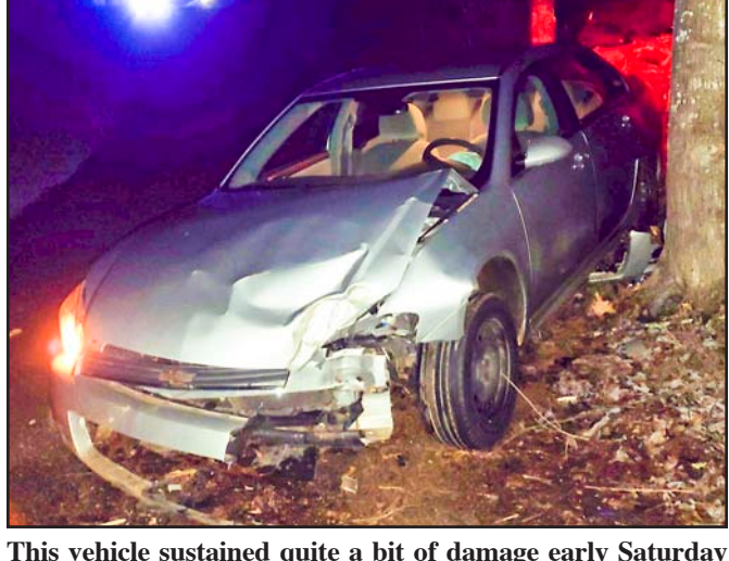
This vehicle sustained quite a bit of damage early Saturday morning after sliding on black ice covering Georgia 180.

even get on the road." 'Regular tune-ups and maintenance are the starting point for safe driving year- conditions, and plan your route winter-driving-safety.